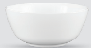
SOUP BOWL 120 mm • 380 ml