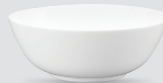
SERVING BOWL (S) 178 mm • 1.1 L