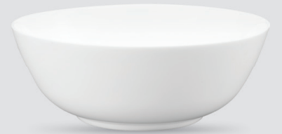
SERVING BOWL (M) 205 mm • 1.63 L