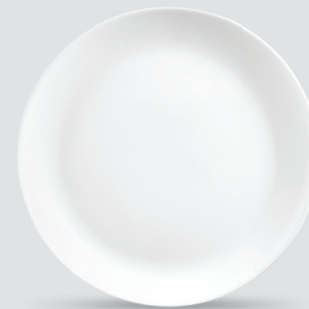
QUARTER PLATE 190 mm